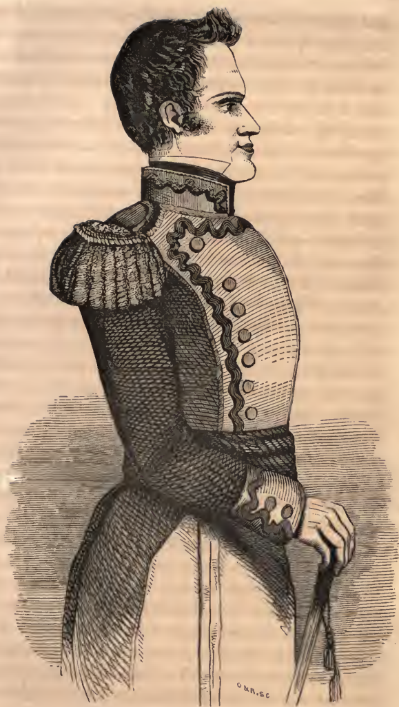
DON ANTONIO LOPEZ DE SANTA ANNA.